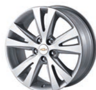
18" Alloy Wheel LT

*Fuel consumption calculations according to Government ECE R101 or SANS 20101 standards.